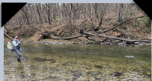
FWM trip to the Catoctin Creek