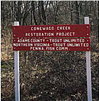
A new sign marking the Conewago Creek Zigler Mill road entrance has been installed.

In wadeable water I fish with a floating line and a sinking tippet. From a boat, in deeper water, I fish with a sinking line. The fish run in schools so if fishing from an anchored boat and other boats are catching fish but you aren't you need to up anchor, move a few yards to one side or the other, and try again until you get over a school and start catching fish. I like using a seven-weight rod the best.